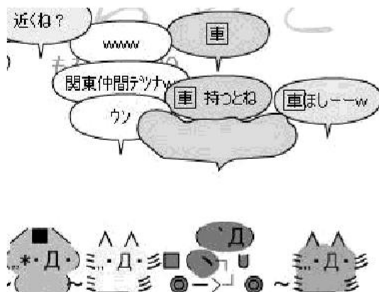
Fig. 1. A screen shot of an avatar chat where word co-occurrence is seen

based on input features extracted by singular value decomposition (SVD) from their co-occurrence in each slot. Due to not considering discussion topics, the approach has arguably low performance in discovering conversation chatter pairs, as shown in [4], when multiple discussions are on-going concurrently by many chatter groups.