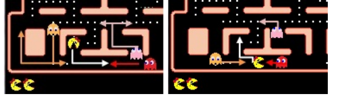
Fig. 2. Example of how to use the predicted direction of Ms. Pac-Man for controlling ghost to make a pincer attack. The arrows show the path Ms. Pac-Man and ghosts should take according to the predictor and ghost MCTs.